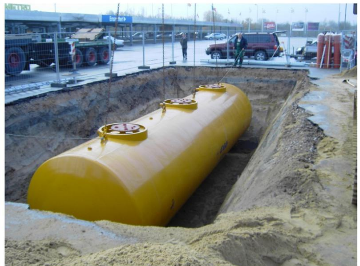
60 m 3 double skinned tank in 3 compartments