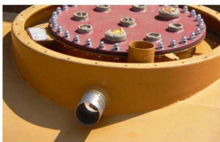
DN600 man way with frame for installation of access shaft, including stainless steel drain pipe

The tanks are available with a wide selection of accessories such as anchoring systems, sumps, street covers, pipes, overflow protection etc.